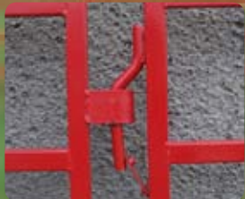
Heavy-Duty Panel Connection

Tired of climbing over your corral panels? Try a Titan West Portable Walk-Thru Panel. Available in 10' and 12' lengths.