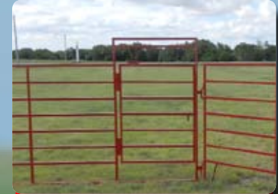
Portable Walk-Thru Panel

Titan West's Portable Panel Trailer is constructed of square and rectangle tubing for a lifetime of dependable service. The axle is 4" ID pipe, capable of safely transporting up to 30-10' or 12' portable panels. The trailer is equipped with a 2" heavy-duty, hammerblow coupler, sidewind jack and tie-down strap and 15" wheels and tires.