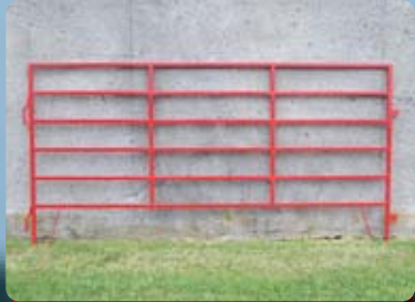
Heavy-Duty Portable Panels

Titan West's portable panels are made with a 1-1/4" high-tensile square tubes and feature cut-to-fit, vertical-square-tube spacers every four feet. As standard equipment, Titan West installs a special unhook-prevention device on every portable panel. Panels available in 60" (6-bar) or 69" (7-bar) heights and 10', 12', 14' and 16' lengths.