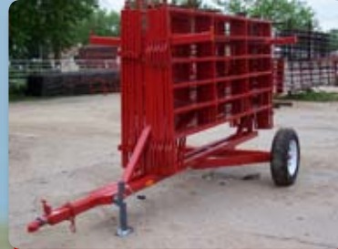
Portable Panel Trailer

Titan West's portable panels are made with a 1-1/4" high-tensile square tubes and feature cut-to-fit, vertical-square-tube spacers every four feet. As standard equipment, Titan West installs a special unhook-prevention device on every portable panel. Panels available in 60" (6-bar) or 69" (7-bar) heights and 10', 12', 14' and 16' lengths.