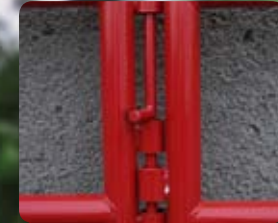
Classic Panel Connector Top