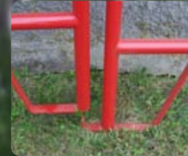
Classic Panel Connector Bottom

Made of 1.66" High-Tensile Round Tubing Perfect for Round Pens & Arena Applications Available in 10' & 12' lengths All Panels (Vertical & Horizontal) use 16-Gauge Tubing Standard Heights are 6-bar (60" Tall) or 7-bar (72" Tall) 5' x 9' Bow Gate